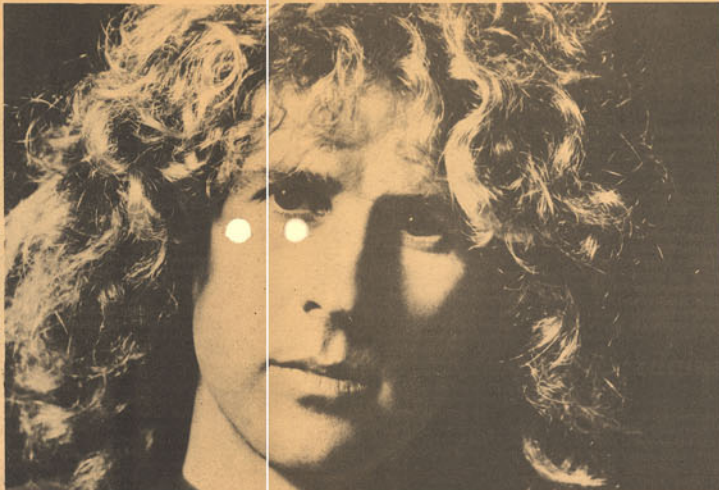
SAMMY HAGAR... Swing on fire last month strikes up a true blue rock star pose.