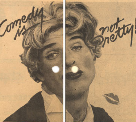
STEVE MARTIN displays his special brand of humor on his album cover photo.