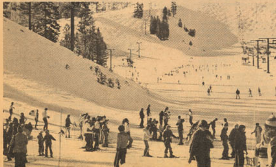
SKIERS hit the hot slopes of cool Snow Valley.